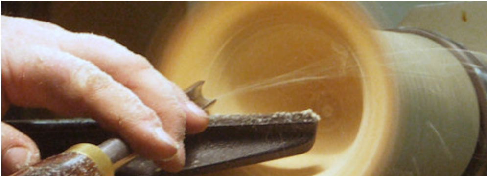
Starting the bowl inside