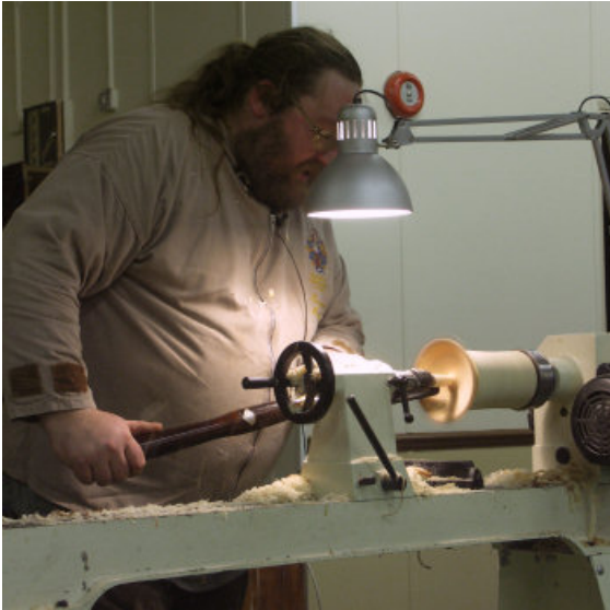
3 Hollowing - with tail stock support