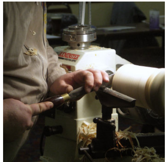
1 Starting the chuck recess

Finally he turned the stem of the vase and parted it from the base.